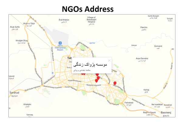
Fig. 2 Services of the web-portal

web-based portal facilitates dissemination of public health information [27], as is the case in the current study. Comprehensive monitoring is needed to notice changes in the pandemic and the effectiveness of public health interventions and their social acceptance [28]. Portals enhance communication and social acceptance. The prevention section of the web-portal will address close information regarding the process of public training, the epidemic of the disease, and follow-up the method provided. In addition, step-by-step information regarding the process of tracking and protecting vulnerable, unprotected people, the elderly and Slumdog, which can be covered by some NGOs, is presented. NGOs activities in web-portal framework are monitored by Tabriz University of Medical Sciences. Furthermore, the number and type of donation items such as masks, gloves, and disinfectants are available on this portal.